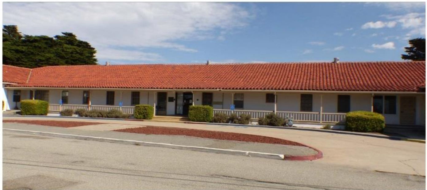
At last we have a new permanent meeting place - Veterans Transition Center, Marina CA