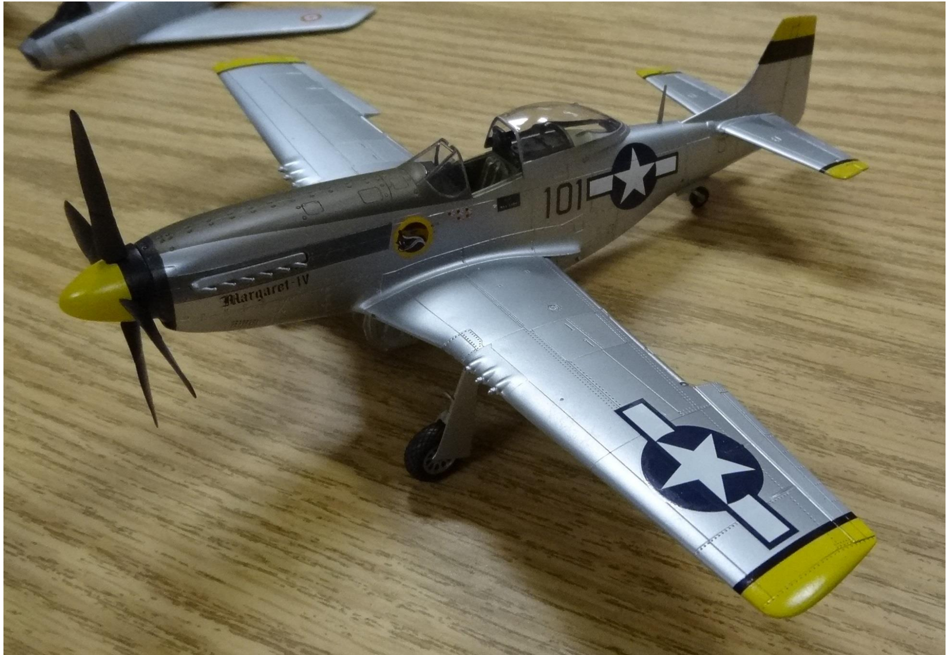
Margaret IV is a P-51D Mustang from the Airfix kit, mostly. Ben used aftermarket decals and “some” Tamiya kit parts here ...