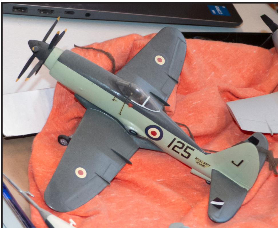
S.4 Wyvern, Royal Navy, Frog 1/72 "Old Frog kit, once considered desirable. Done as a comparative to my racer version."