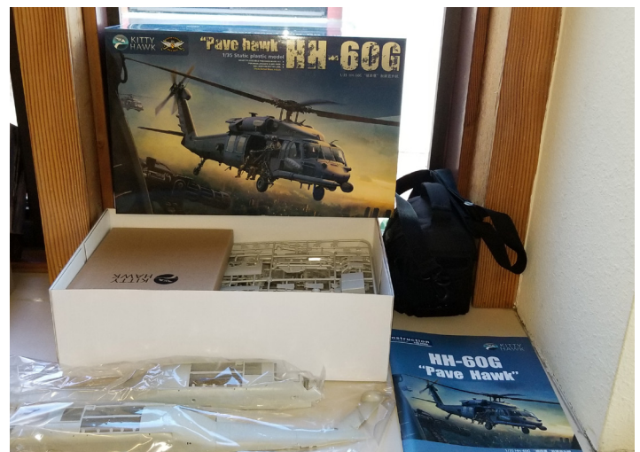
RAMON LOMELI continues on his Hasegawa 1/48th scale Grumman F-14D Super Tomcat inching closer and closer to completion. Also for our inspection is the new 2012 Tamiya 1/48th scale Ilyushin IL-2 Shturmovik, 2017 AMK (AvantGarde Model Kits) 1/48th scale Israeli IAI Kfir C2/C7, and the 2019 Kitty Hawk 1/35th scale HH-60G Pave Hawk, all awaiting assembly.