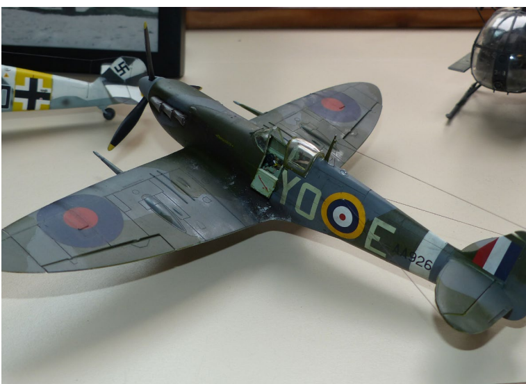
OLIVER LOMELI is back displaying a myriad of pieces, all beautifully rendered: a 1/48th scale Eduard Polikarpov I-16 Type 24 "Mosca", a Monogram 1/48th scale Messerschmitt Bf-109G-14 Gustav, an Airfix 1/48th scale Supermarine Spitfire Mk V, a Kitty Hawk 1/35th scale MH-6J Little Bird (with a fully exposed engine compartment) and for you ground pounders, a Dragon 1/72nd scale M1A1 Abrams Main Battle Tank.