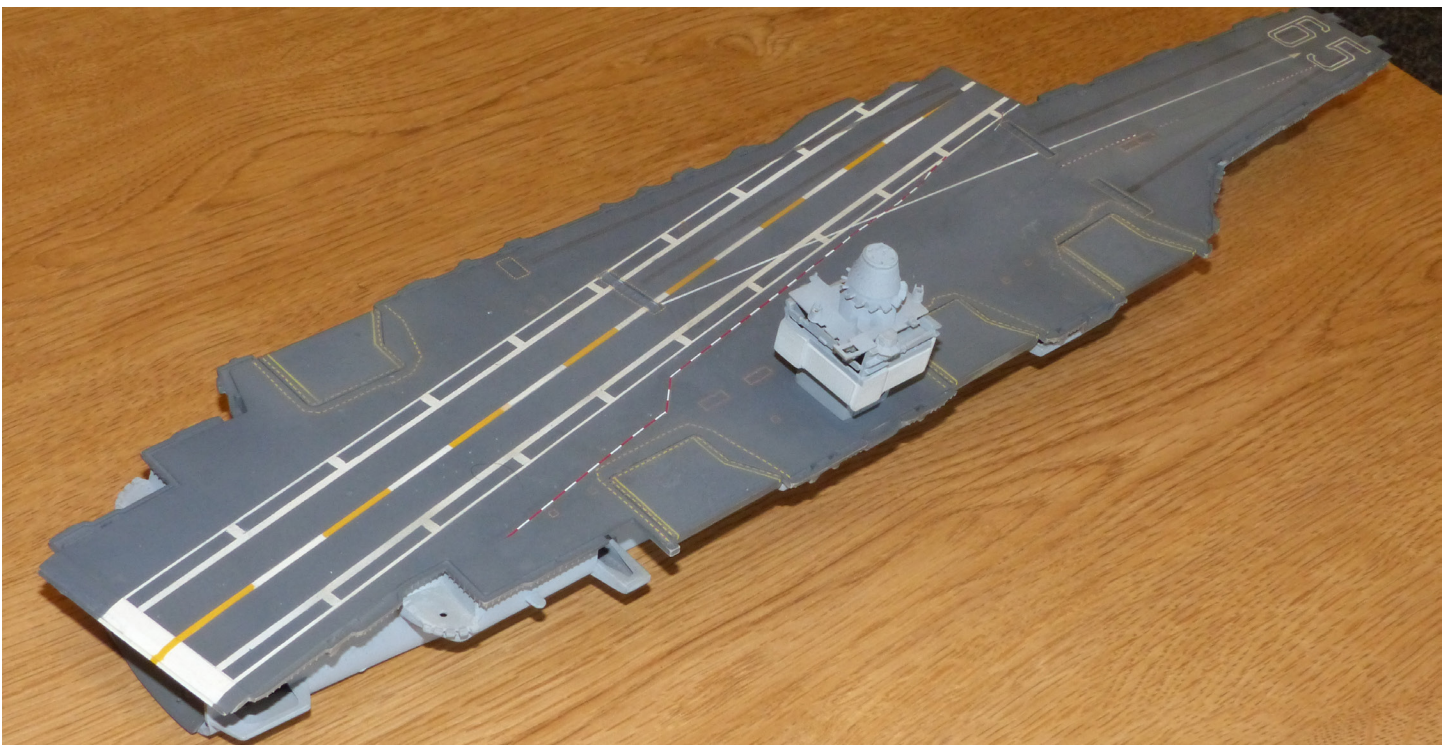
Launched in 1961, the USS Enterprise was the US Navy's first atomic powered aircraft carrier. Like all of Tom's flat tops, this 1/720th scale REVELL of GERMANY is a jewel, especially when you study the intricate deck detail.