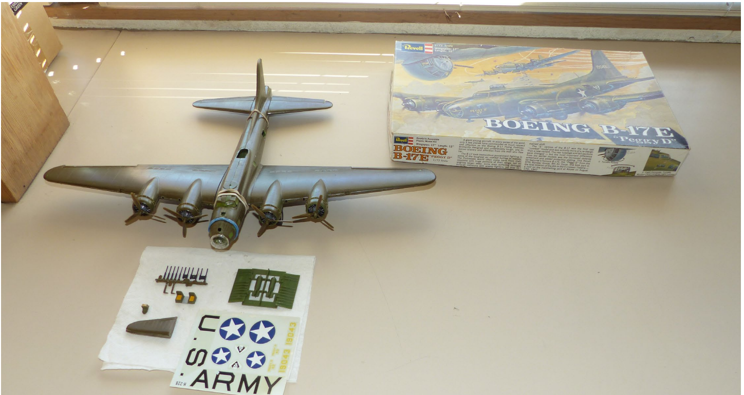
David followed up the rear with a Revell 1/72nd scale B-17E that he is building for the Veteran's Transition Center