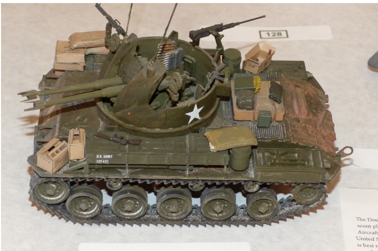
The Doug scout play Aircraft I United St is best re