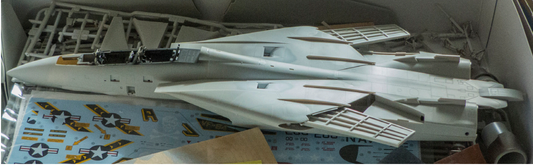
Tamiya 1/48th scale Grumman F-14A Tomcat

RAMON LOMELI started us off with three WIPs: