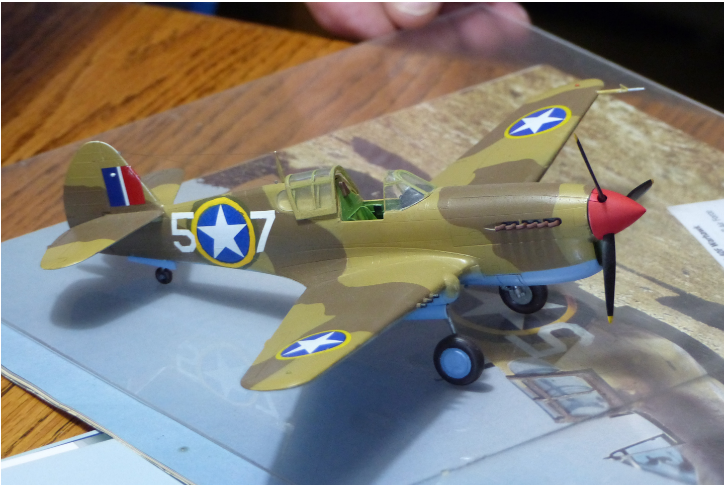
DAVID CONNEAU presented an AMT 1/48th scale short-tailed Curtiss P-40F Warhawk (ex-RAF Kittyhawk) finished in RAF Dark Earth/Middlestone upper surfaces with RAF Azure Blue undersurfaces, serving in North Africa (January 1943).