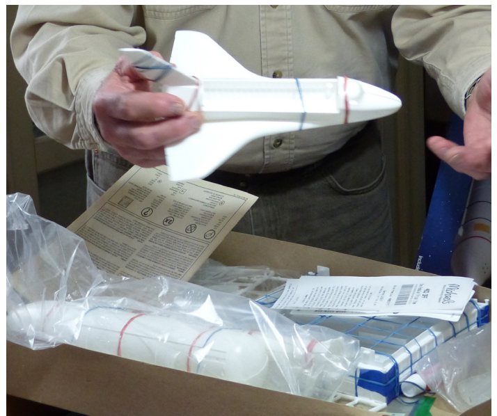
EVAN CONNEAU is boldly going to continue building his Revell 1/144th scale Challenger Space Shuttle. It's only logical.