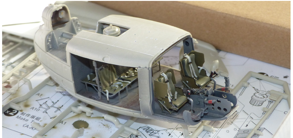
Kitty Hawk 1/48th scale Bell UH-1 Huey