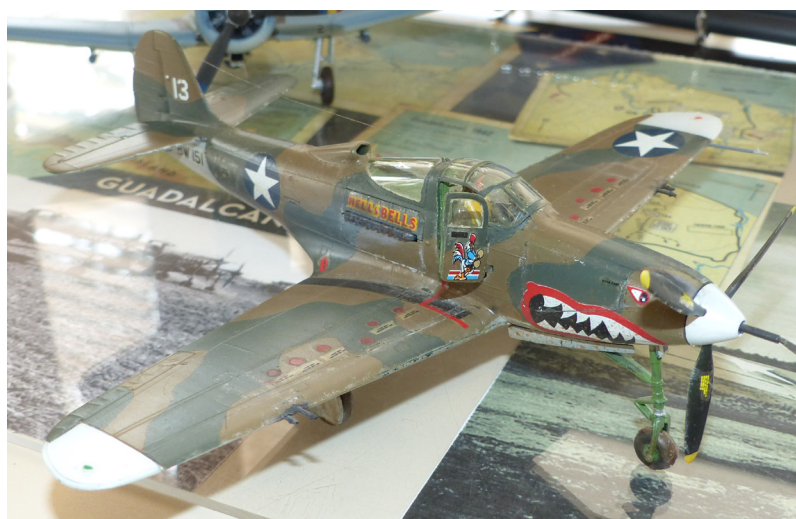
A 1969 Monogram 1/48th scale Bell P-40 Airacobra of the 67th FS, 347th FG, Henderson Field (August 1942).