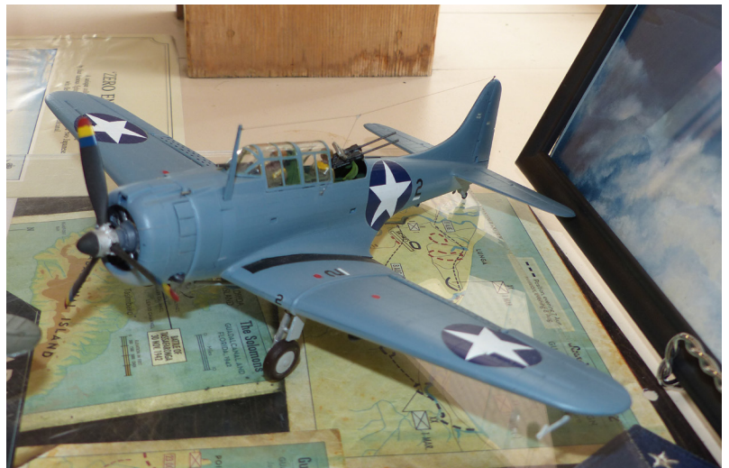
A 1959 Monogram 1/48th scale Douglas SBD-3 Dauntless of Scouting Squadron 71 (VS-71) from USS Wasp (CV-7) detailed to Henderson Field (September 1942).