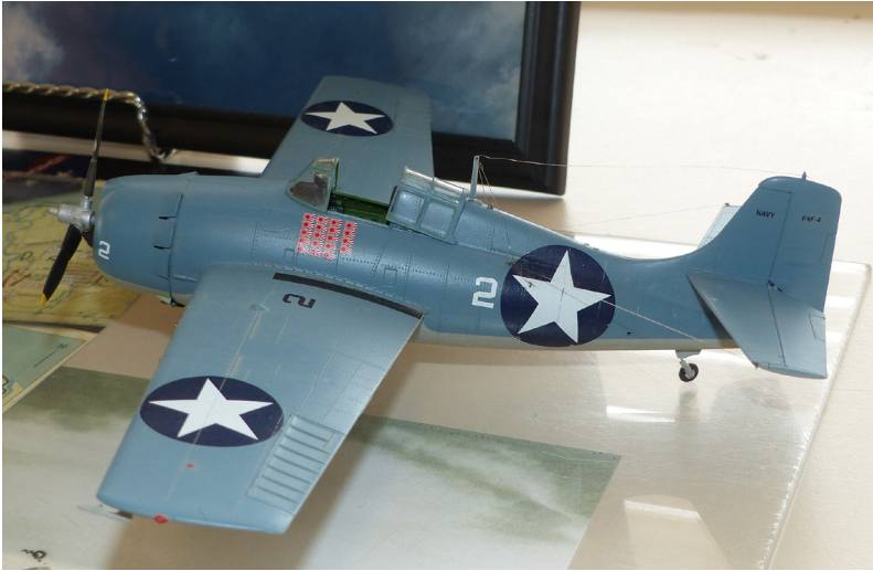
A 2007 Hobby Boss 1/48th scale Grumman F4F-4 Wildcat of Marine Fighter Squadron 223 (VMF223) in the markings of Capt. Marion E. Carl (August 1942).