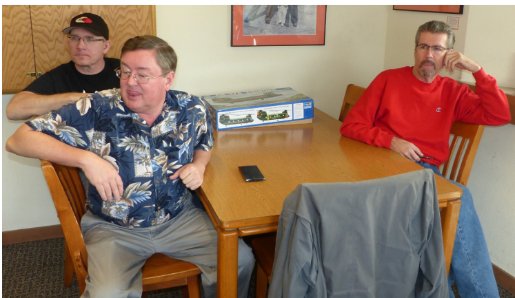
Did someone say cookies?!

That's ended our December meeting. Again, our next meeting will be at David's house on the 2nd Sunday of January. Directions to follow closer to the day. That wraps it up for 2016 - see you all next year!