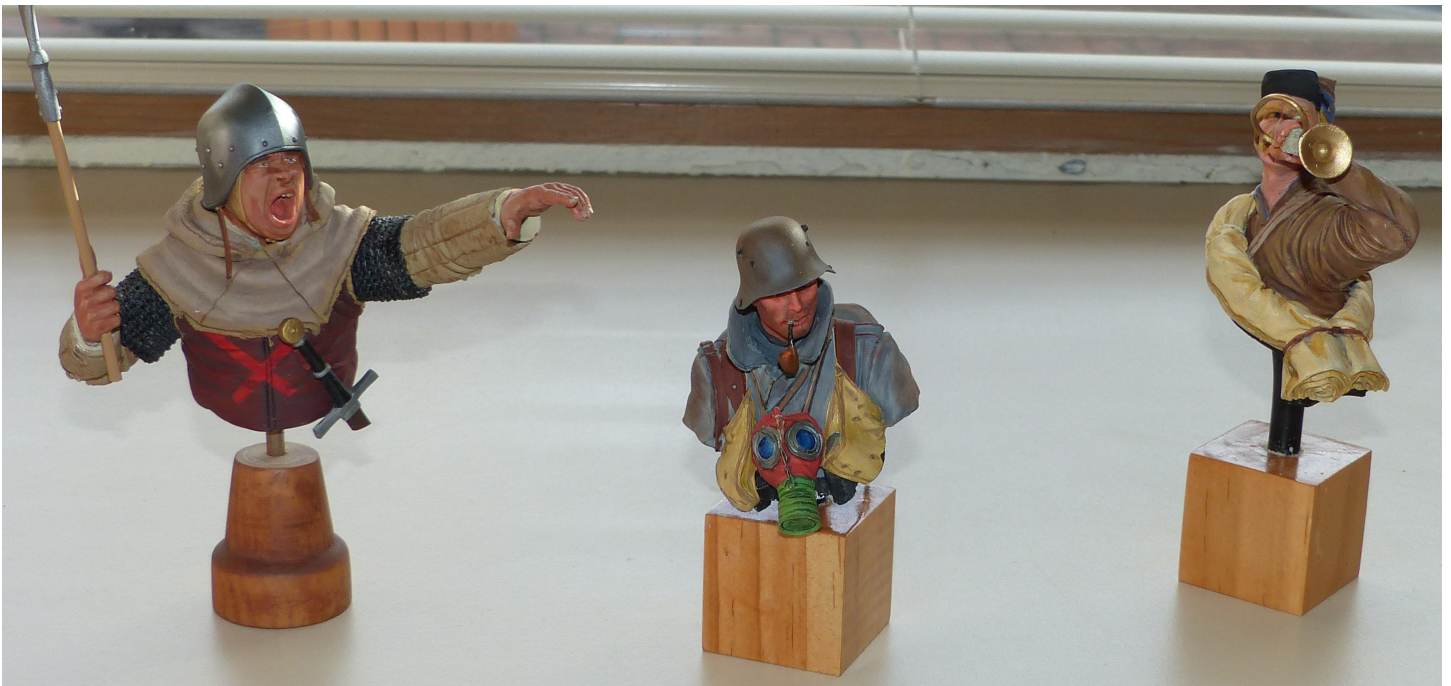
I was next with 3 busts, the first is a Union Bugler, ACW, 1863. The next was a medieval pikeman from Burgundy, circa 1475. Last is a German WW I Trench-raider, circa 1916. If you look closely at the left side pouch, you can see what is most probably a poison gas canister.