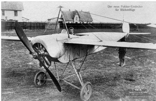
Anthony Fokker, early E.1 (below)