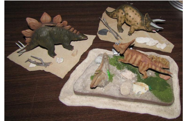
(L - R) A relative, featured subject, “the 3 dinos ”